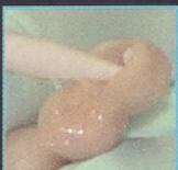
Simple to Use Automix Syringe