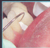
Sets in Two Minutes Cleans Up Easily

Basic Package contains one GC Temp Advantage Syringe and 15 Mixing Tips.