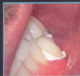
Superior Handling Flows Well